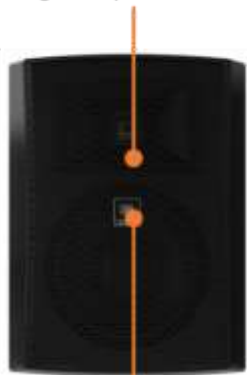
Rotatable Logo for Horizontal and Vertical Applications