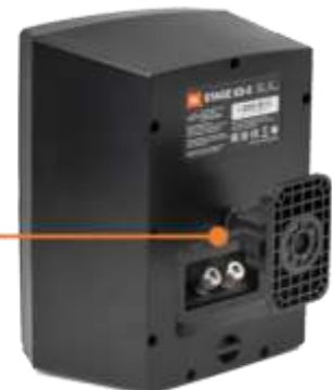
Included Versatile Post Ball Mount