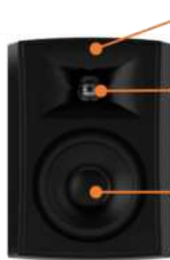
Compact IP67 waterproof cabinet